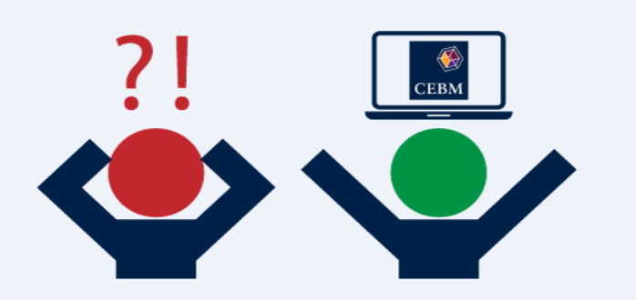
What if the sensitivity or specificity is also not reported? Kathy Taylor

In my previous two posts I considered data extraction for diagnostic accuracy studies. In post DA1, I showed how to derive the 2x2 diagnostic accuracy table from the reported sensitivity, specificity, prevalence and study size. Then, in post DA2, I showed how, if the prevalence is also not reported, it could be calculated using the number with the disease, the positive predictive value (PPV) or the negative predictive value (NPV). In this post I'll explain how to deal with the less common case when a sensitivity or specificity is not reported.